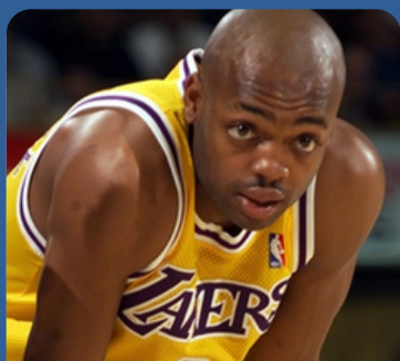
NICK VAN EXEL - CLASS OF 2020

CLICK BELOW TO NOMINATE PLAYER, COACH OR CONTRIBUTOR FOR THE CLASS OF 2022 HALL OF FAME NOMINATION FORM