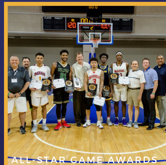
ALL-STAR GAME AWARDS